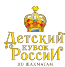
Детский кубок россии по шахматам Children's Cup of Russia 2025