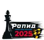
RAPID Grand Prix 2025