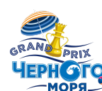
Black Sea Grand Prix 2025