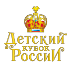
Children's Cup of Russia 2025