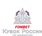
FONBET Russian Cup 2025