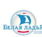
White Rook 2025